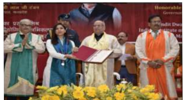
STUDENT BEING AWARDED DEGREE BY THE CHIEF GUEST HON'BLE GOVERNOR OF M.P. SHRI LALJI TANDON JI