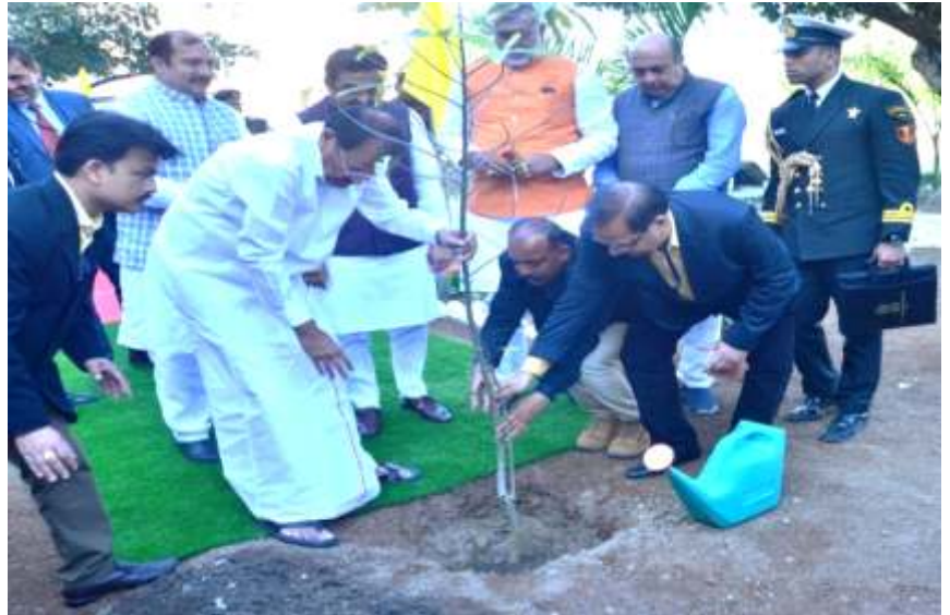
Plantation of Rudraksha Plant on 15.02.2020 By Shri. M. Vankaiah Naidu, Hon'ble Vice President of India

Tree Plantation Works The Horticulture works, and tree Plantation works, including maintenance of plants and lawns near and around all the buildings, along the Roads and Pathways and other parts of the campus, have been carried out throughout the year. The plantation work in the campus is being done under the valuable consultancy services and the Horticulture Plan provided by the Tropical Forest Research Institute (TFRI), Jabalpur.