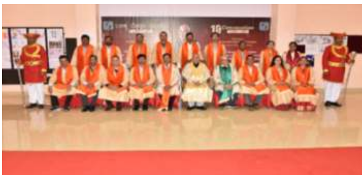
DIRECTOR, DEAN AND HODs ALONG WITH THE BOARD OF GOVERNORS, IIITDM JABALPUR WITH CHIEF GUEST HON'BLE GOVERNOR OF M.P. SHRI LALJI TANDON JI