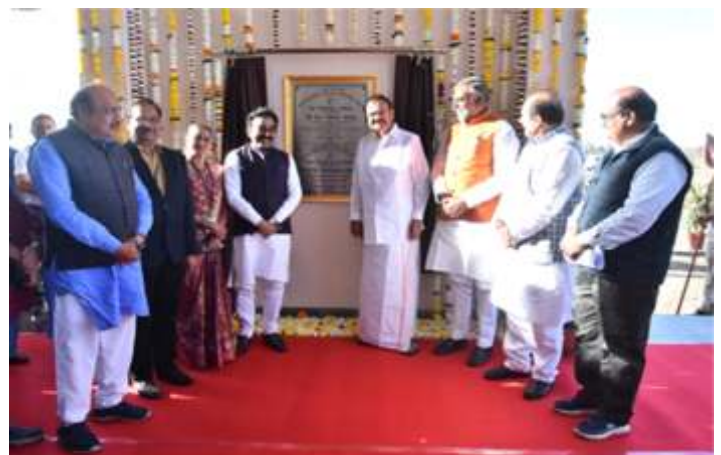
Glimpses of Inauguration of NR-III and Rewa Residency II (A & B) Complex By Honb'le Vice President of India Shri M. Venkaiah Naidu Ji