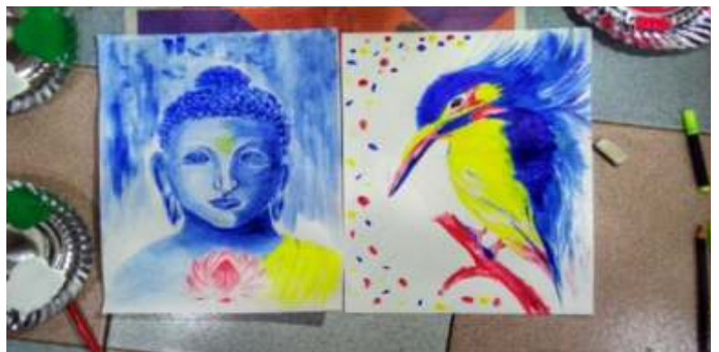
Wall Paint Event under Abhivyakti