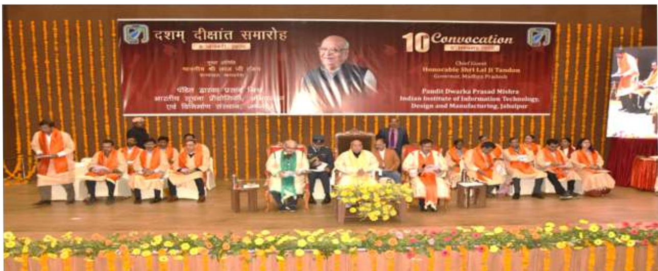
DIGNITARIES AT THE DAIS DURING THE 10 TH CONVOCATION CEREMONY

The 10th Convocation of the Institute was held on January 8, 2020 for 2018 and 2019 passed out students. The occasion was graced by the Hon'ble Governor of Madhya Pradesh Shri Lalji Tandon Ji and Shri Deepak Ghaisas, Chairperson, Board of Governors of the Institute along with other dignitaries. Parents and guardians of the graduating Students and distinguished guests from Jabalpur and other parts of India also attended the event. A total number of 786 degrees were awarded. Medals and prizes were also awarded for the outstanding performance of the students.