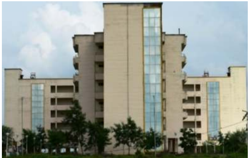
Narmada Residency III